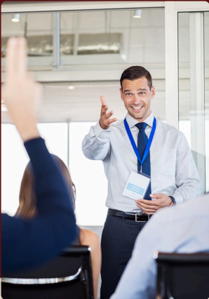
Training & Coaching

We offer a holistic approach to business growth, providing expert training and coaching, seamless language translation, strategic business development and marketing, and efficient business setup processes. Our tailored services equip you with the tools and knowledge to succeed.