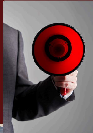
Business Development & Marketing Consultancy